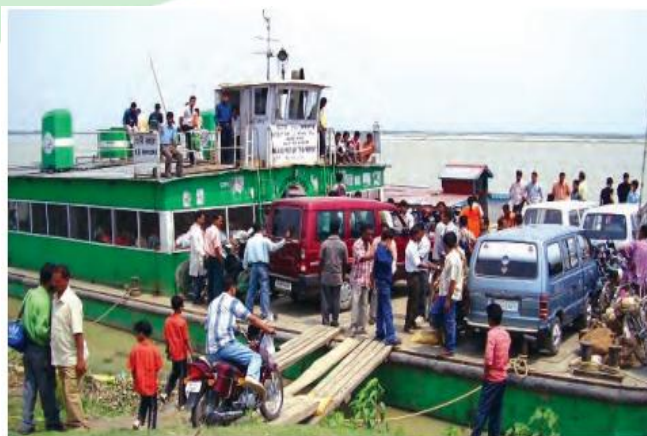
Inland waterways widely used in north-eastern states

Waterways are the most important means of transporting bulky and heavy goods. It is a fuel-efficient and environmental friendly means of transport. Inland waterways connect rivers, canals, backwater and creeks within the country. The following waterways have been declared as national waterways by the