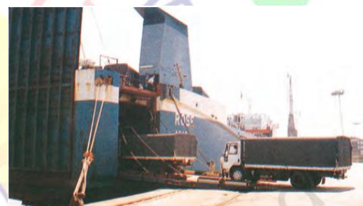
Trucks being driven into the vessel at Mumbai port