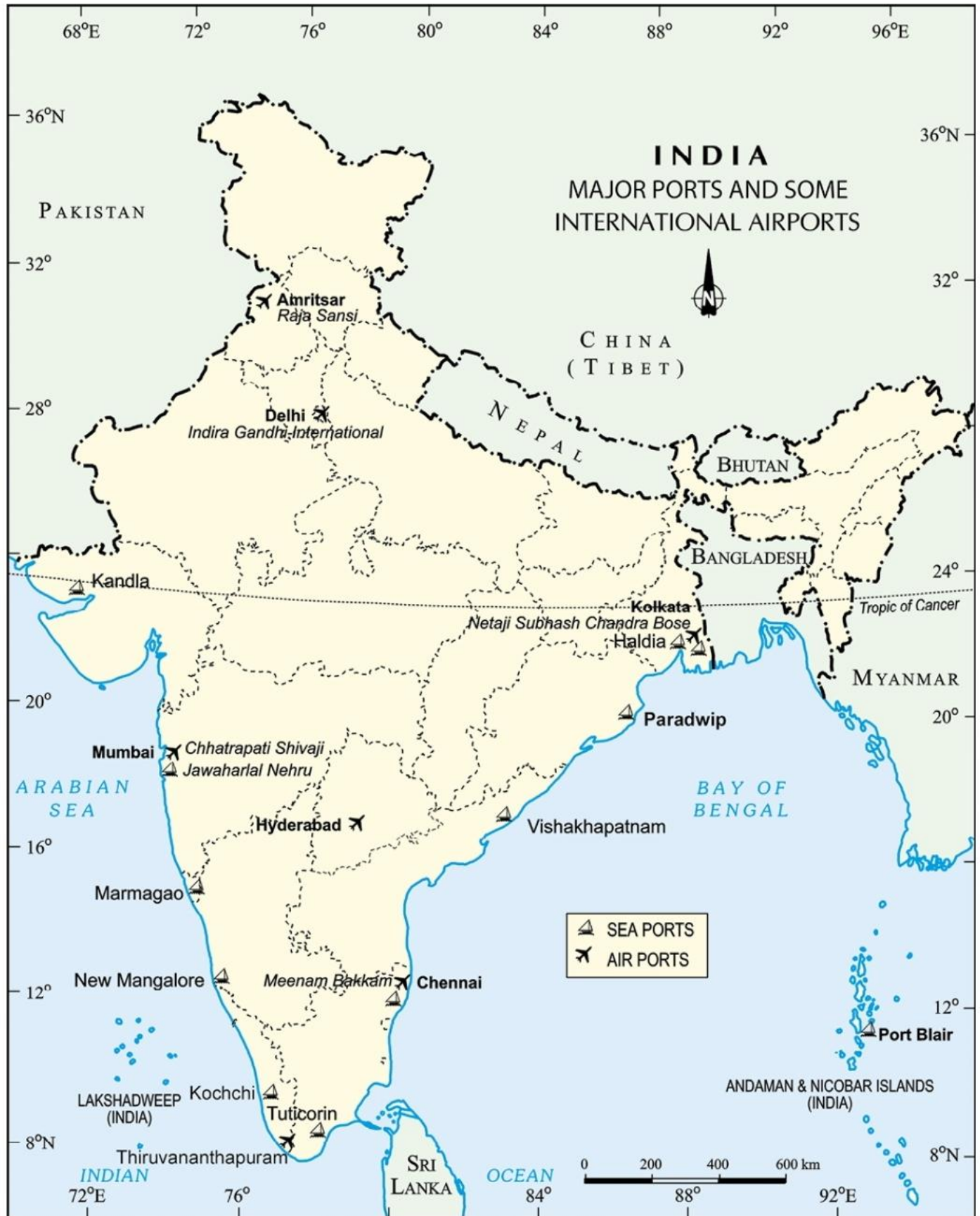
India: Major Ports and Some International Airport