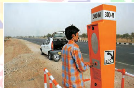
Emergency call box on NH-8