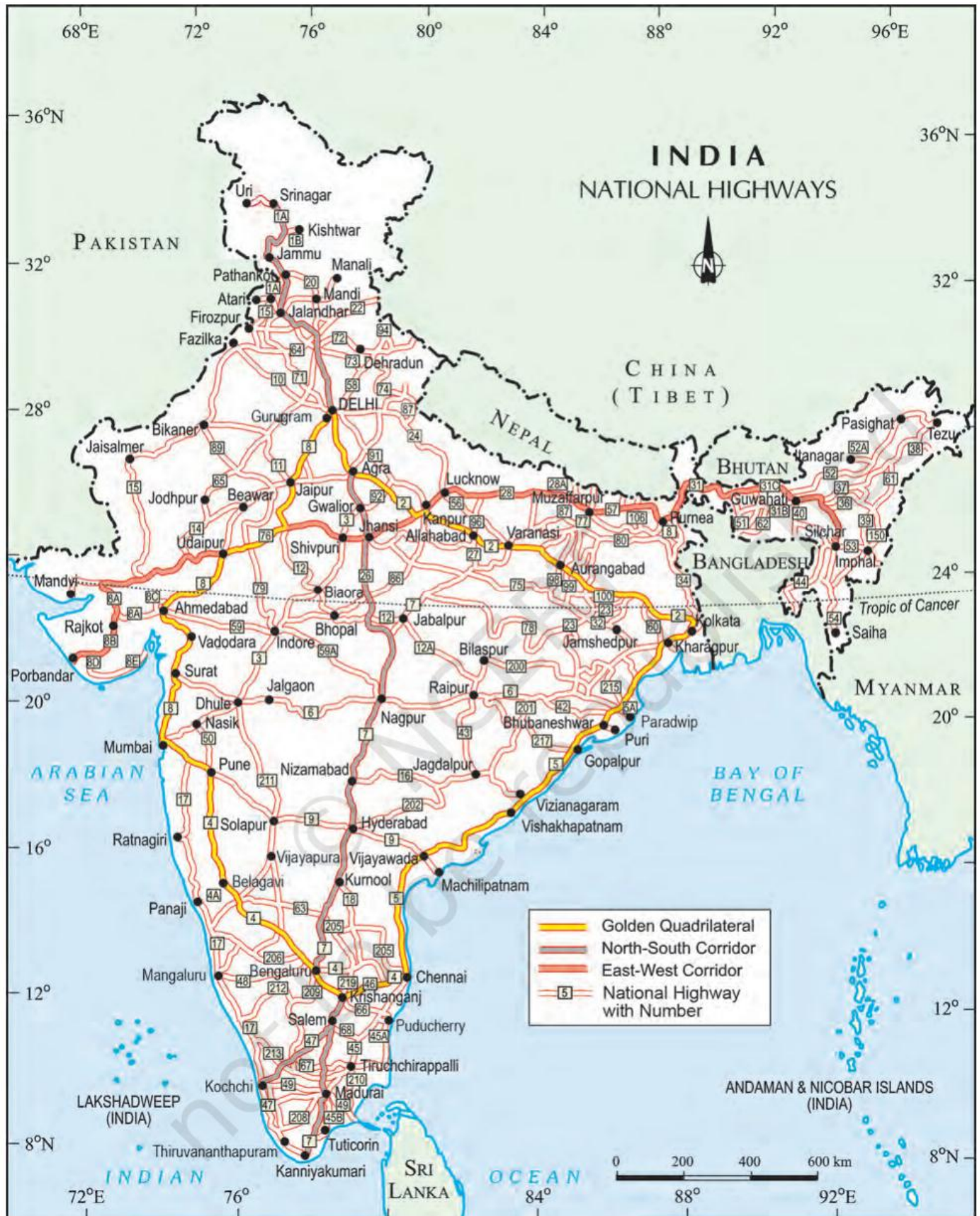
India: National Highways