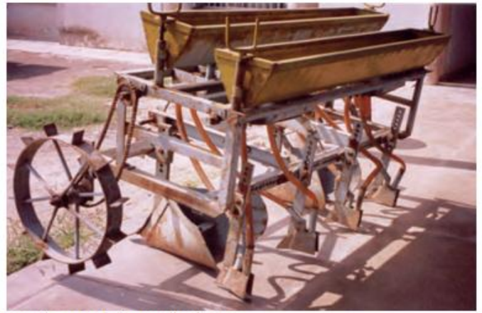
Modern technological equipments used in agriculture