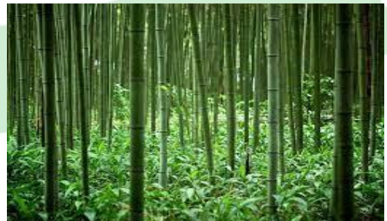
Bamboo plantation in North-east