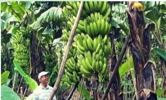
Banana plantation in Southern part of India