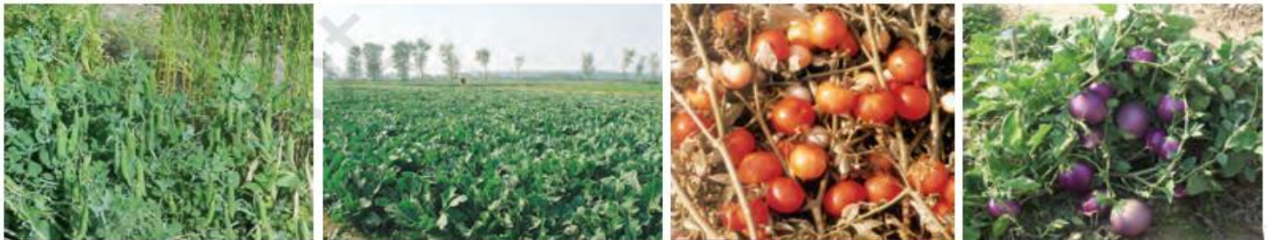
Cultivation of vegetables – peas, cauliflower, tomato and brinjal