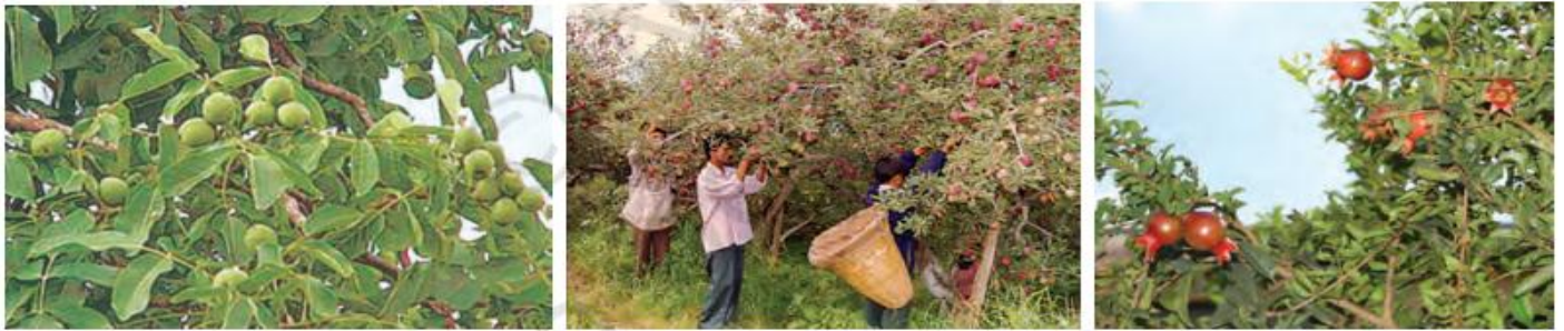
Apricots, apple and pomegranate

important producer of peas, cauliflower, onion, cabbage, tomato, brinjal and potatoes. There is a potato institute in Shirnla where study is made on various qualities of potatoes grown in India.