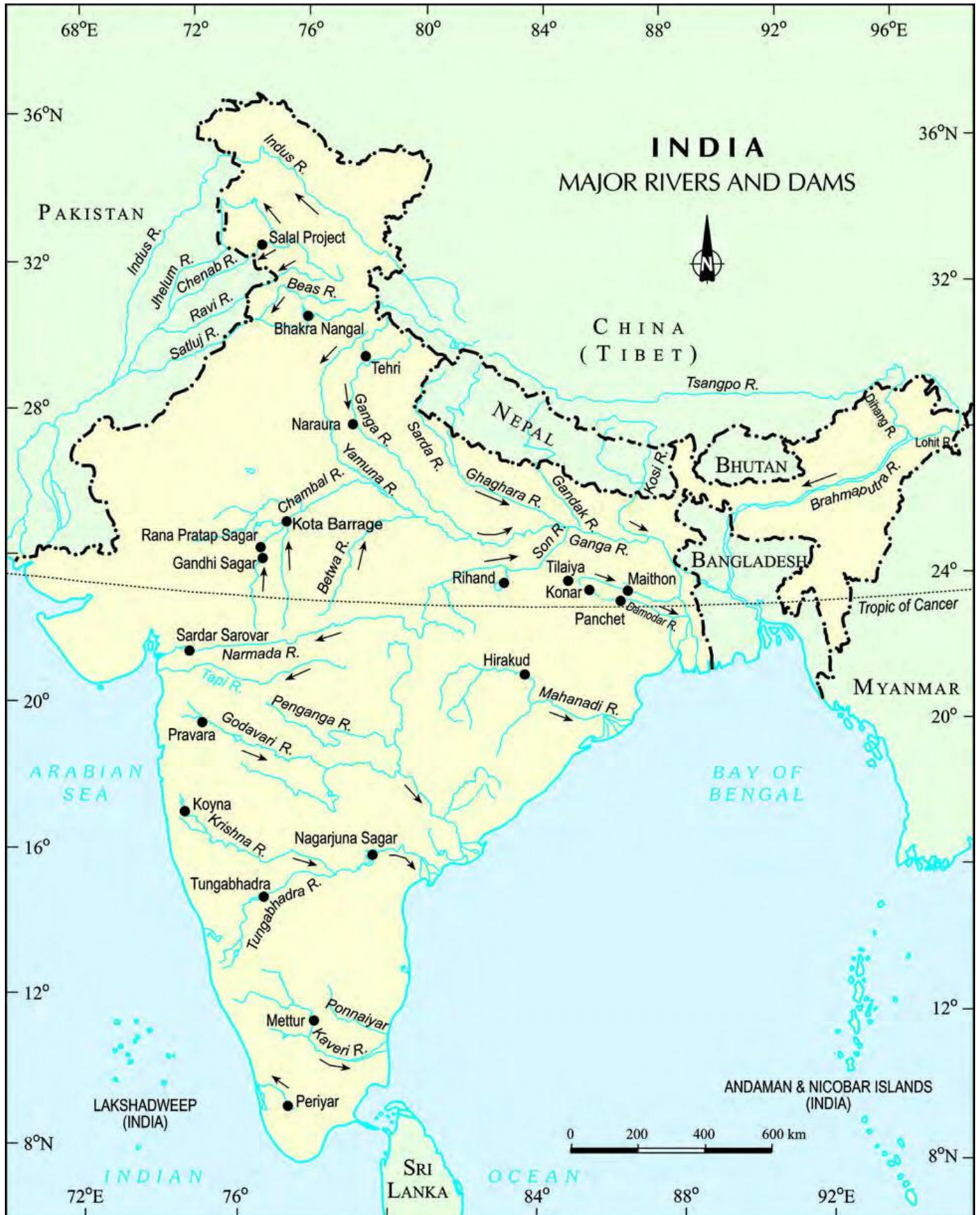
India: Major Rivers and Dams