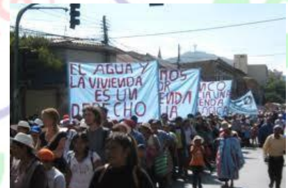
Protests in Bolivia took place when a private company increased water rates