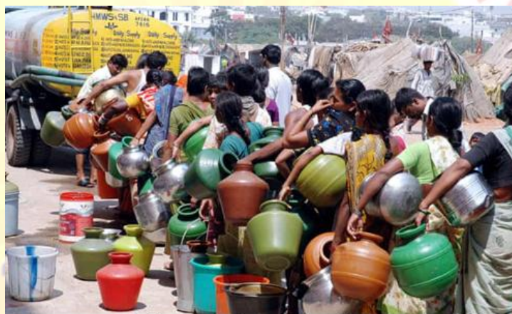
In poorer neighbourhoods, people often queue up for water and ugly fight sometimes ensue.

Those who can afford it solve the problem of short supply by buying water from private companies or by digging bore-wells. Those who cannot, have to Manase with far less than what is generally considered the minimum requirement of about seven buckets per person. Thus, people living in slums may have to manage with less than one bucket per person, while people living in well- to-do neighbourhoods may use more than forty or fifty buckets per person.