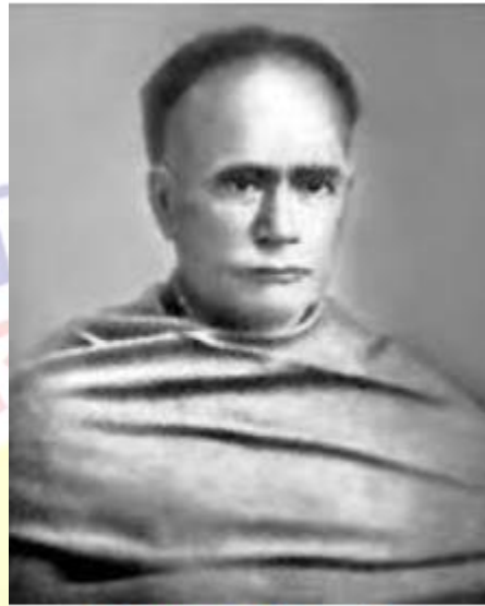
Ishwar Chandra Vidyasagar