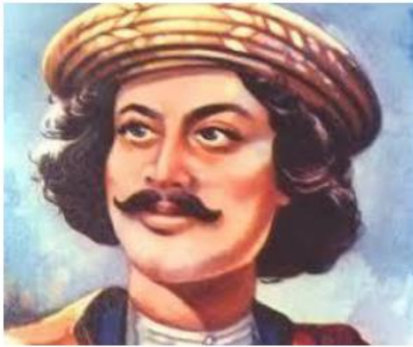
Raja Rammohun Roy

Ishwar Chandra Vidyasagar also used ancient scriptures for advocating remarriages of widows. The British in 1856 legalised remarriages of widows. In the Madras Presidency, Veerasalingam formed an association for widow remarriages. Dayanand Saraswathi also supported widow remarriages. However, at the same time, many people were also opposing the work of reformers.