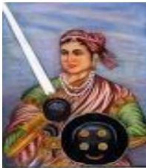
Rani Laxmibai was one of the leading figures of the Indian rebellion which broke out in 1857.