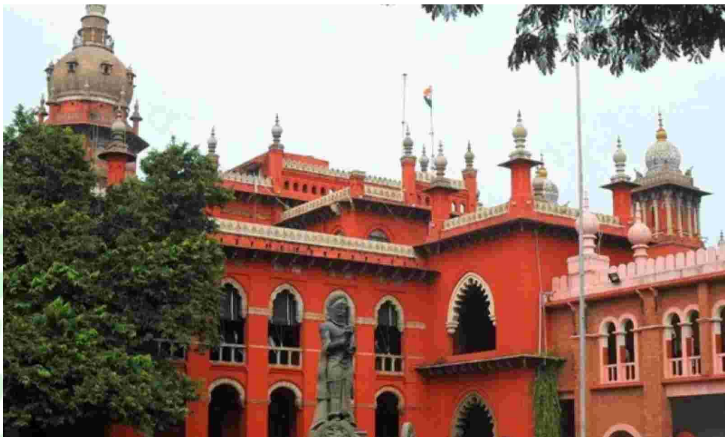
The madras High court Which, Serves Tamil Nadu and Puducherry