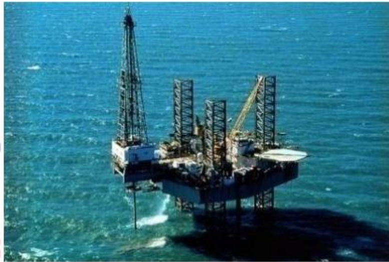
Offshore drilling of oil