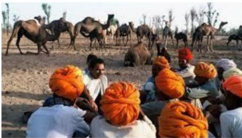
Raikas mainly live in the deserts of Rajasthan

move through different terrains and they establish relations with the farmers while moving. They also combine a range of various activities such as trade, herding and cultivation to make a living.