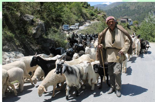
Gaddi shepherds of Himachal Pradesh