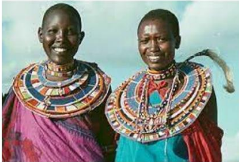
Women of the Maasai community of Kenya