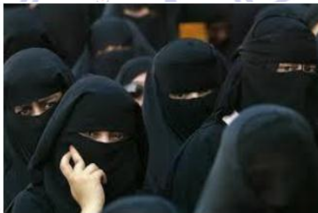
Women in Saudi Arabia do not have the right to vote