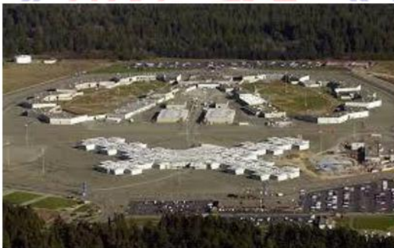
Prisons in Guantanamo Bay