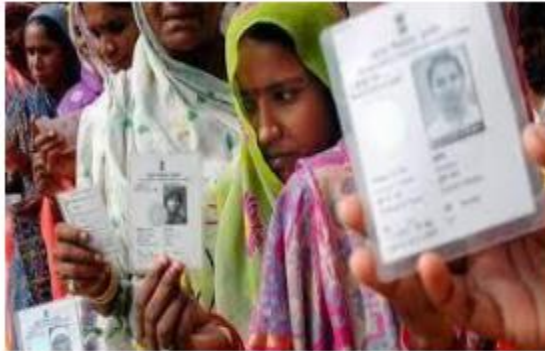
A lady showing her voters identity card while voting at the booth.