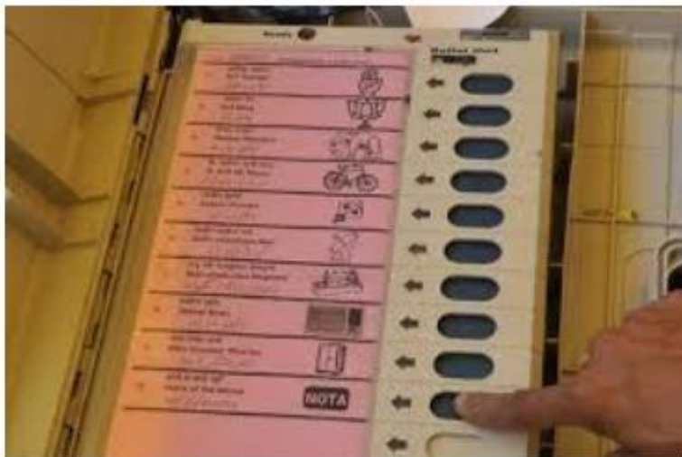
Electronic Voting Machine