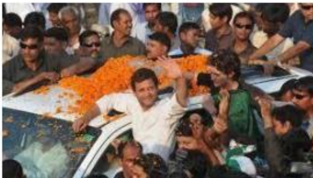
Political campaigning by the leaders of a major political party