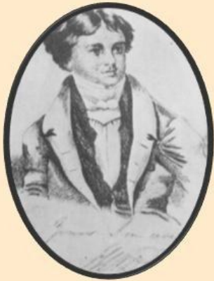
Henry Louis Vivian Dereozio