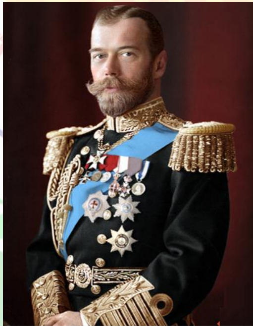
Tsar Nicholas II