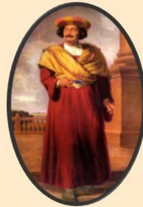
Raja Rammohan Roy

The three main groups of people at this time were